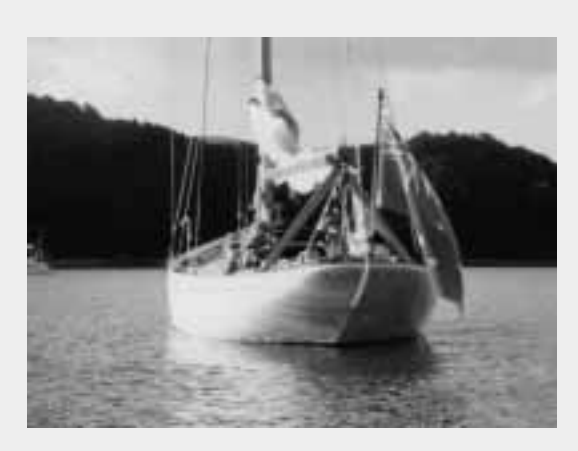
Tawera in Third Bay on Ponui's eastern coast