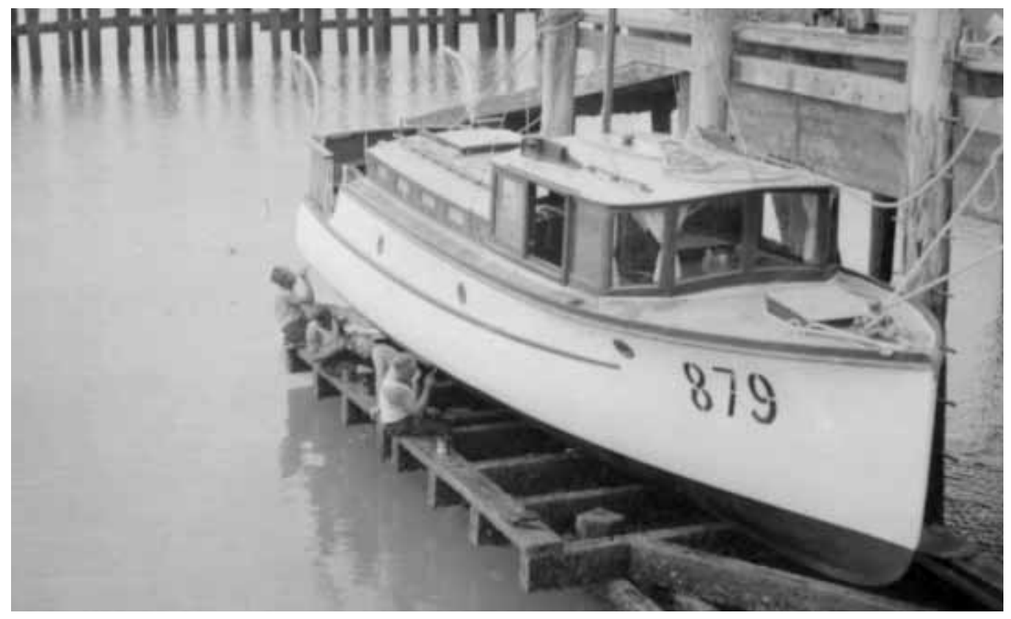
The Col Wild cruiser Royal Saxon on the launch grids at Whakatakataka Bay towards the end of World War 2