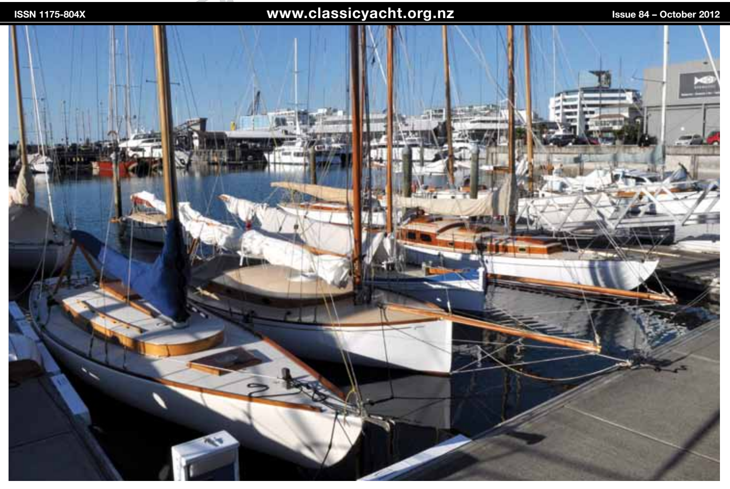
Part of the Tino Rawa Trust fleet in the Viaduct Harbour

PO Box 911055, Victoria Street West, Auckland 1142.