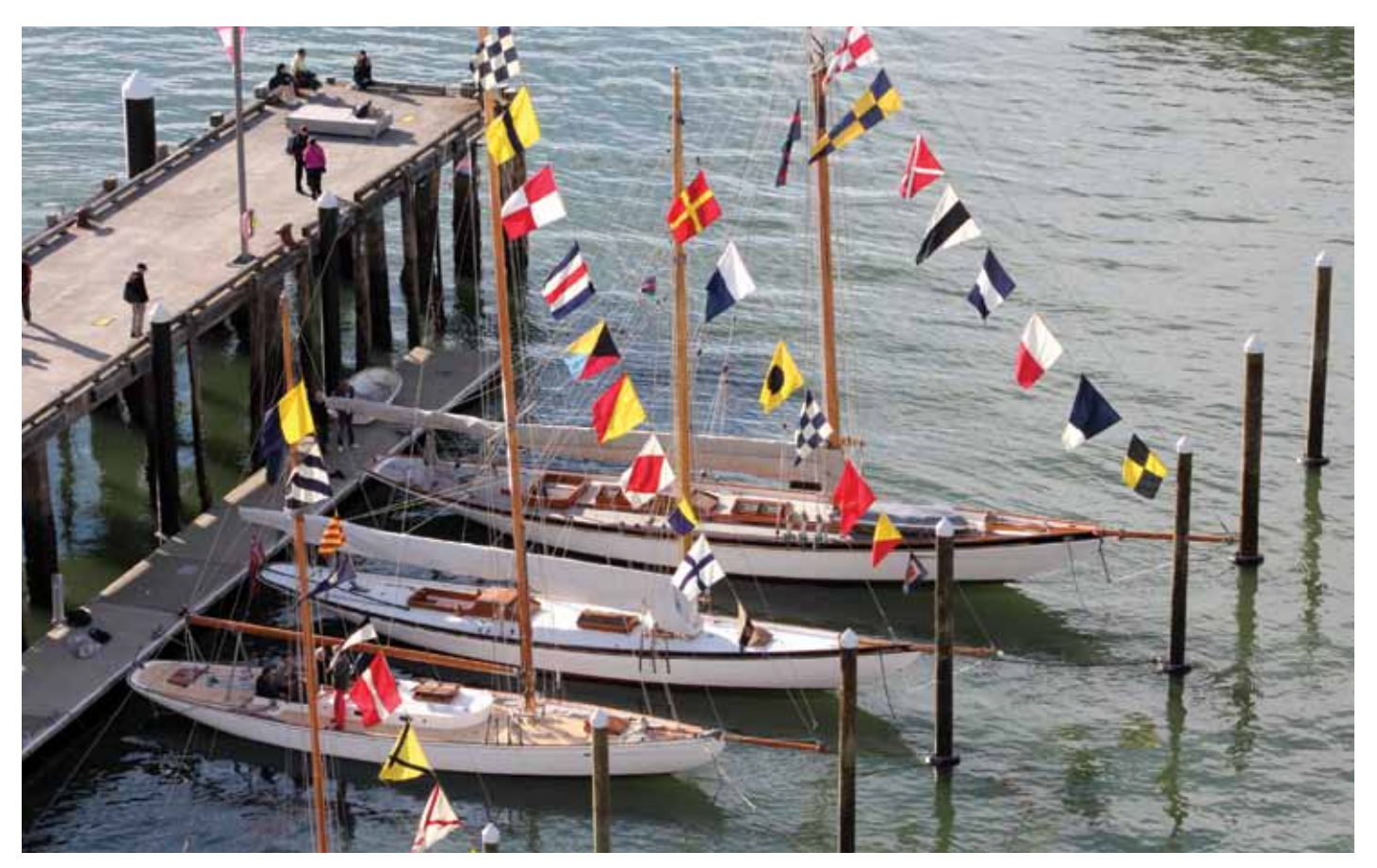
Above and below: Bedecked in celebration bunting, a line-up of classics at the official opening of the Silo Park facility.