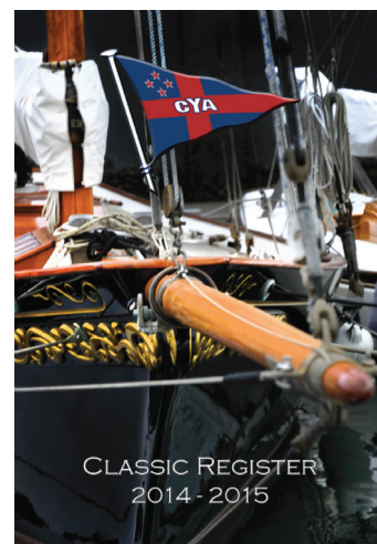
CLASSIC REGISTER 2014 - 2015

Breeze readers can view the Classic Register on-line at http://classicyacht.org.nz/vessel-register/