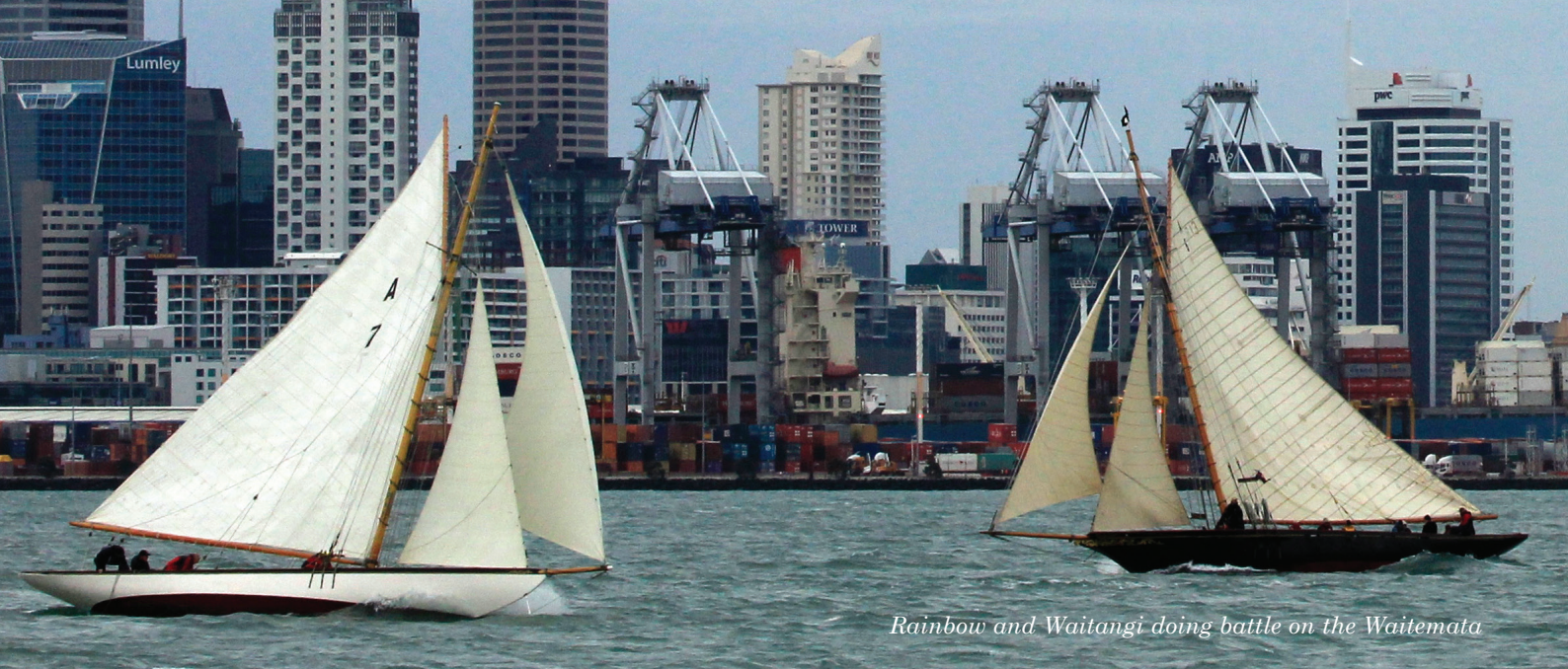
Rainbow and Waitangi doing battle on the Waitemata