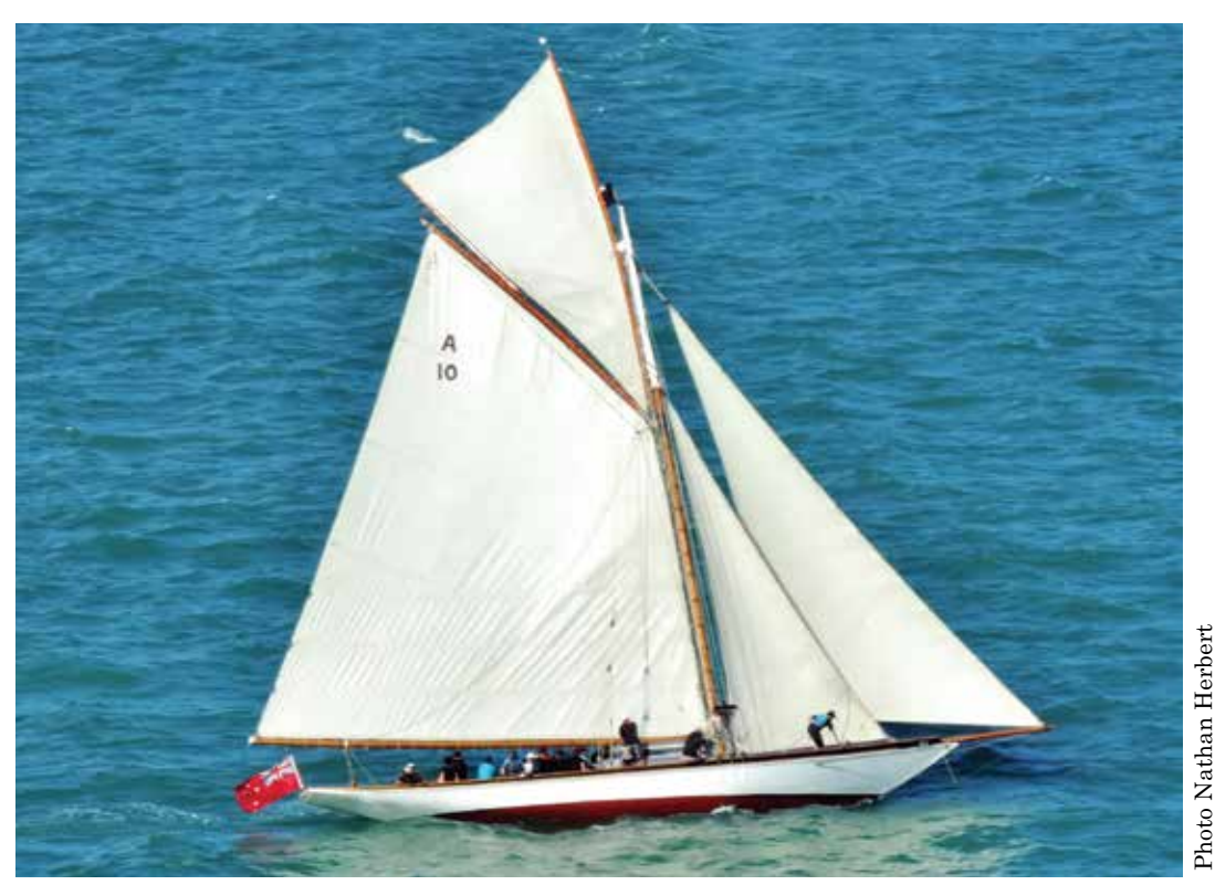
Thelma looking smart as ever at the Anniversary Regatta.