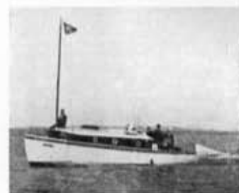
Maroro as she is today (above) and as she was in 1914