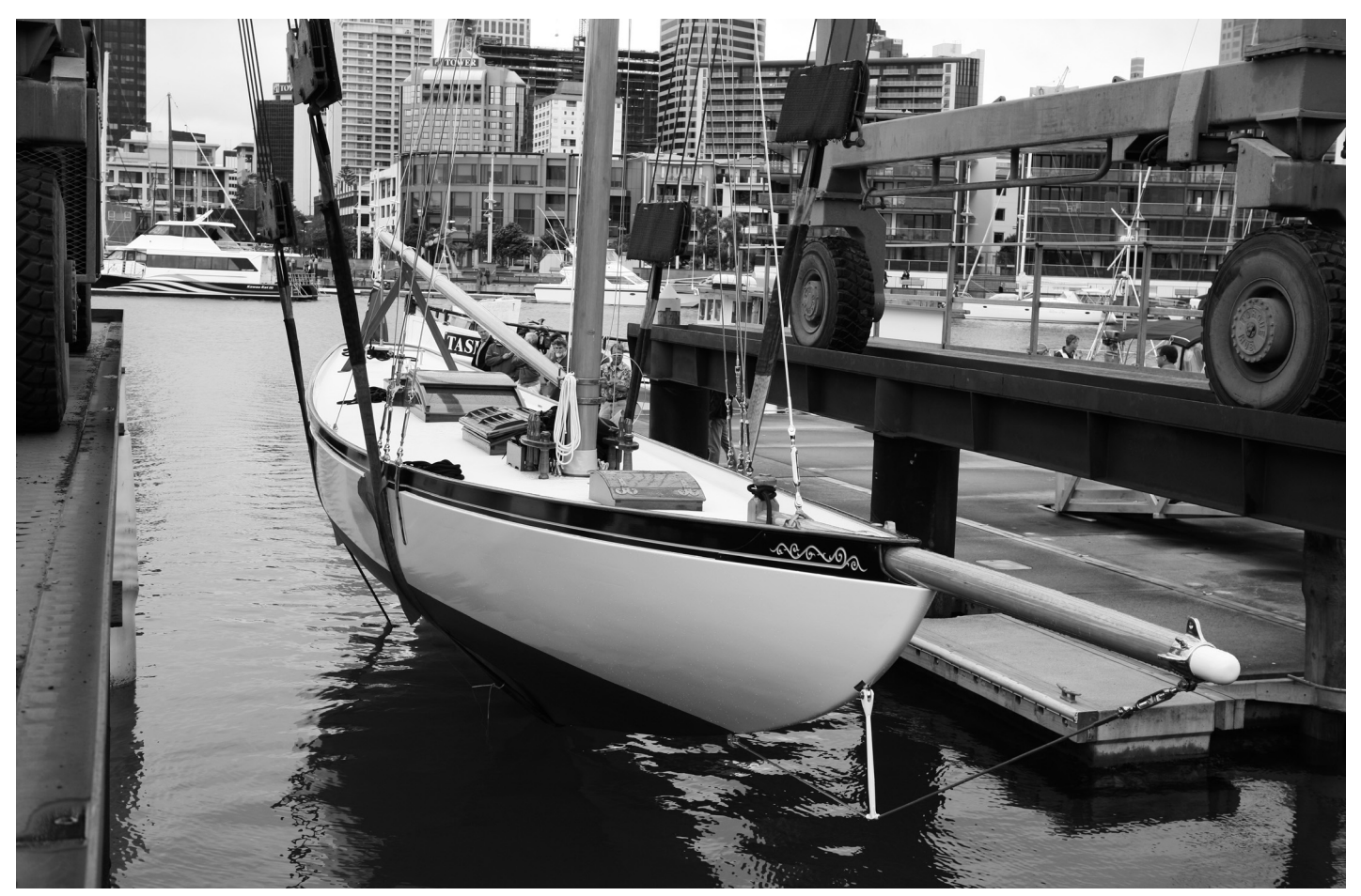
Rainbow's keel touches the water for the first time after its restoration