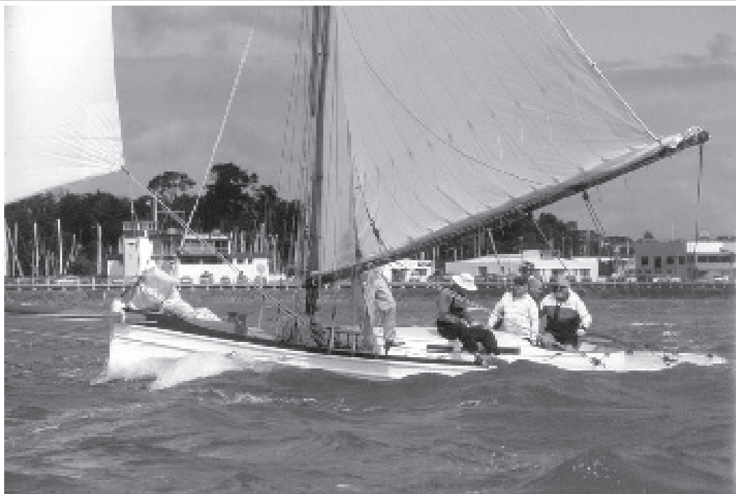
Above: Jessie Logan romping downwind. Below: Fidelis

The 2008-2009 Season will be kicking off quite differently this year with a 1400 nautical mile voyage to the start line of the first race.