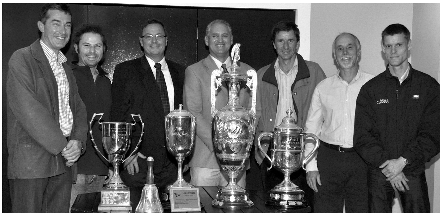
Alan Good Photos