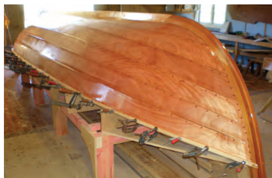
Above: NZ's first St Ayles skiff nearing completion. Left: Just after resin coat.

It is hoped to develop the St Ayles here as a recreational rowing boat that can be used by school groups, community groups and corporates to develop national events. At just over twenty feet long with four rowers and a cox and being such a seaworthy boat opens up fantastic opportunities to hold events and regattas in almost any stretch of water around the country.