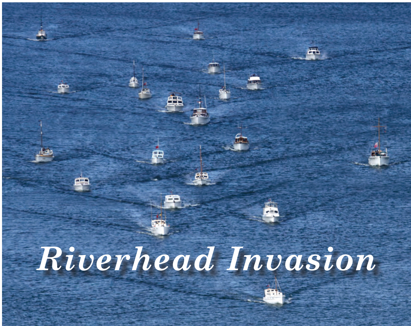
Terry Randall Photo