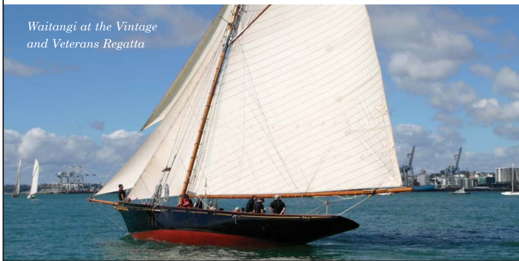
Waitangi at the Vintage and Veterans Regatta

And the harbour series results? All will be revealed at the CYA prize giving on May 21. A big thanks to our host club and a special welcome back to the crew of Gloriana .