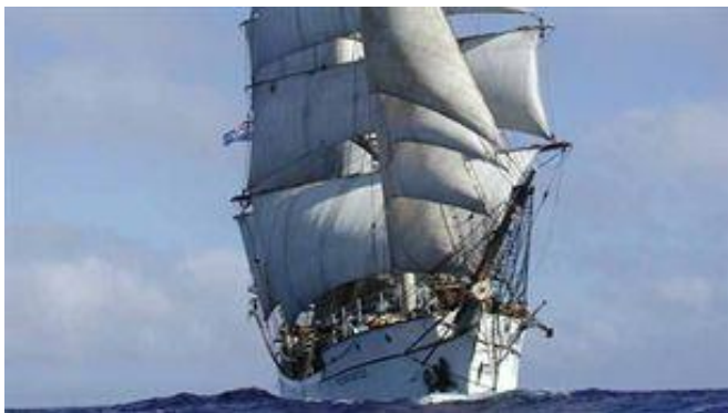
Picton Castle under way

A fleet of Tall Ships and hundreds of sailors will cross the Tasman for a three-day festival to be hosted by the Voyager New Zealand Maritime Museum .